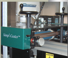
Simpl-Coater ™ Roller Adhesive Applicator