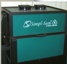
Simpl-Seal ® UV Light Sealant Curing Device

Basic package features motorized tracks that deliver manually filled packages to automated sealant application, pneumatic air knife / pressure roller package closure and UV sealing process. The advanced package could include the following features, providing the ultimate in automated package assembly: