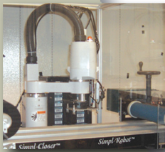
Robotic Product Placement and/or Adhesive Application