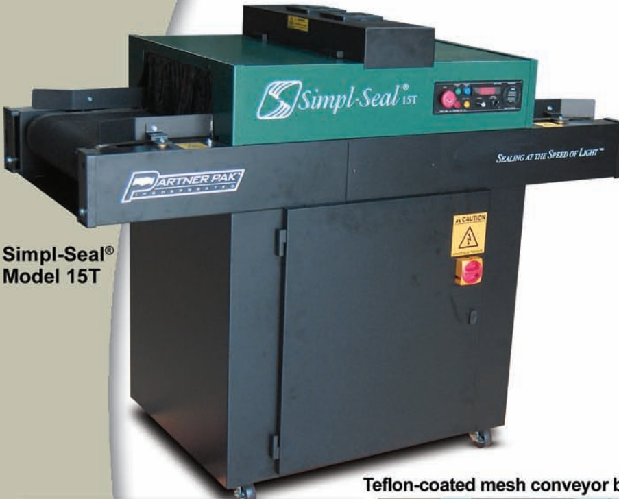
Simpl-Seal® Model 15T

The new standard in clamshell sealing equipment.