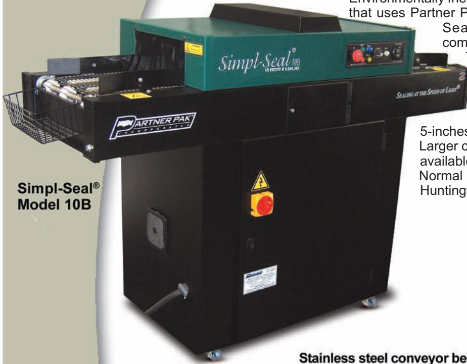
Simpl-Seal® Model 10B

Normal delivery time on all units is 6 to 8 weeks, FOB Huntington Beach, CA.