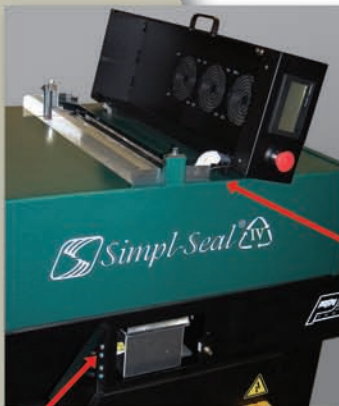
UV light source is easily interchangeable from top to bottom as required