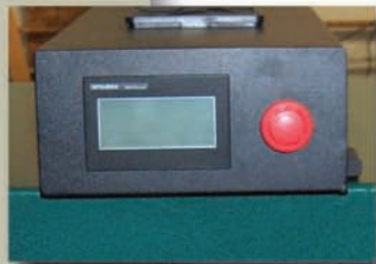
Touch Screen operation indicates all machine functions.